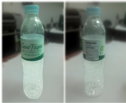
Casino Filipino Mineral Water Bottle Label Design Size: 7.25" x 1.65"

Casino Filipino Mineral Water Bottle Label Design (size: 7.25" x 1.65")